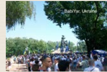
4,000+ in 18 cities of Ukraine 2010