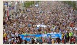
Pastor Bittner is keynote speaker for 25,000 at March of The Living in Budapest 2014