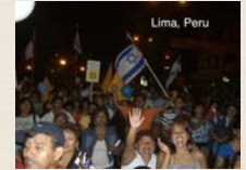
3,000+ in Lima, Peru and more cities of S America

2007 - March of Life goes across Germany from Bisingen to Dachua with 300 children of Nazis; Holocaust survivors leading the way