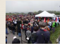
1,200+ in Linz, Austria 2014 Hometown of Hitler